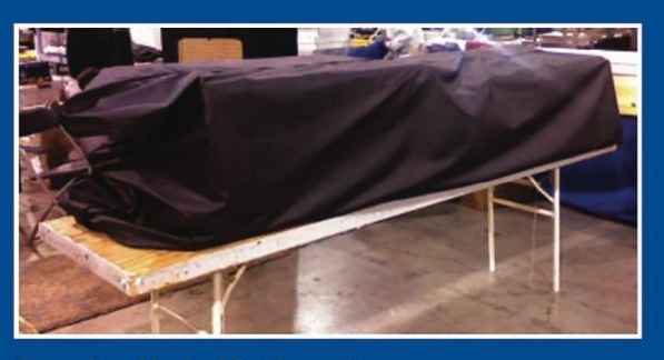
Zipped and locked for the night