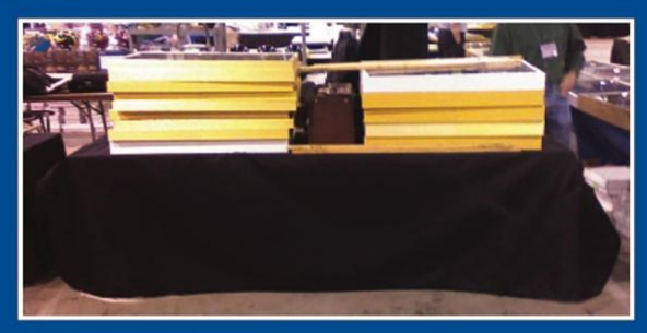
Table cover by day